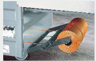
Convenient and firm strapping of the bales thanks to sophisticated strapping technology with polyester tape.